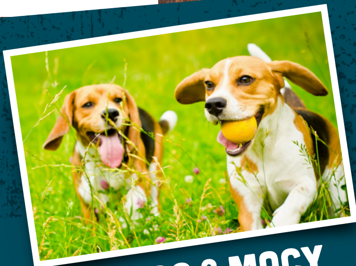
MAC & MACY

REBATES + GIFT WITH PURCHASE AWAIT. DETAILS INSIDE.